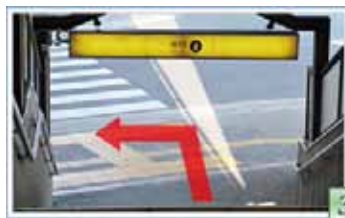
3 I cut down the stairs to the left.