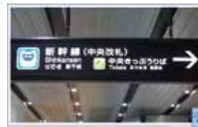
3 Shinkansen central mouth, towards the middle Ticket Office.