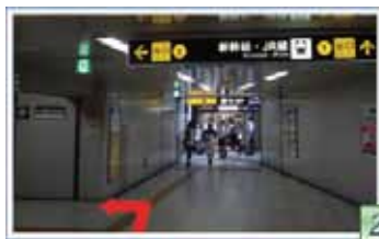
2 I got off the subway exit 2.