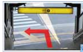
8 I cut down the stairs to the left.