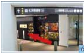
6 Down the escalator, I move toward the front of the subway Midosuji.