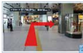
3 Shinkansen central mouth, towards the middle Ticket Office.