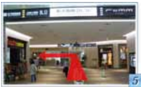
5 Turn left at the T-junction, Escalator down to the first floor concourse.