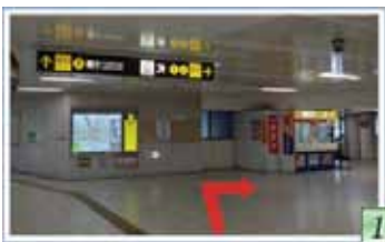
1 Exit north Midosuji subway Please toward Exit 2.