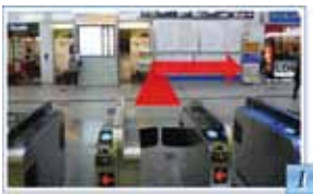
1 Turn right at the exit east Tokaido JR. (Please see the guide 4) right out of the mouth to the center in the case of Shinkansen