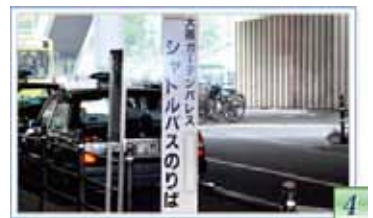
4 I arrived at the shuttle bus.