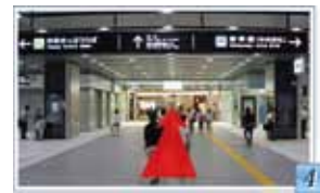
4 I go to the north exit Shin Hankyu Building. Shinkansen is the right direction from the central exit.