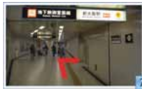
7 On the right side of the subway Midosuji I go down the stairs Exit 2.