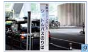
9 I arrived at the shuttle bus.